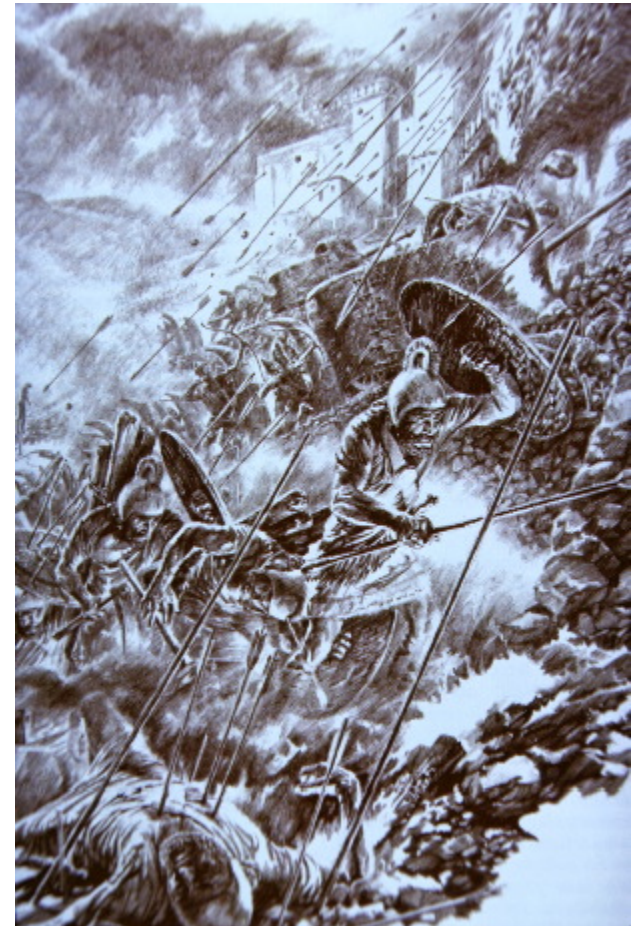
An artist's impression of Sennacherib's army battling in Lachish against Judea.

Because Hezekiah, king of Judah, would not submit to my yoke, I came up against him, and by force of arms and by the might of my power I took 46 of his strong fenced cities; and of the smaller towns which were scattered about, I took and plundered a countless number. From these places I took and carried off 200,156 persons, old and young, male and female, together with horses and mules, asses and camels, oxen and sheep, a countless multitude; and Hezekiah himself I shut up in Jerusalem, his capital city, like a bird in a cage, building towers round the city to hem him in, and raising banks of earth against the gates, so as to prevent escape... Then upon Hezekiah there fell the fear of the power of my arms, and he sent out to me the chiefs and the elders of Jerusalem with 30 talents of gold and 800 talents of silver, and diverse treasures, a rich and immense booty... All these things were brought to me at Nineveh, the seat of my government.