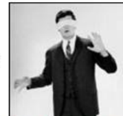
Its Time to anoint our Eyes with Eye salve

Luke 3:17 "His winnowing fan is in His hand, and He will thoroughly clean out His threshing floor, and gather the wheat into His barn; but the chaff He will burn with unquenchable fire."