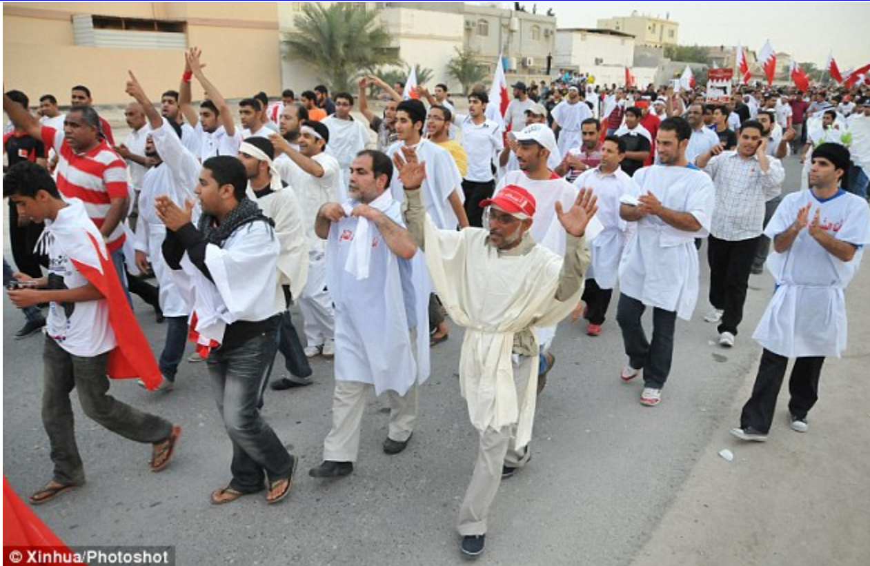
The anti-government protesters marched in Manama over the weekend