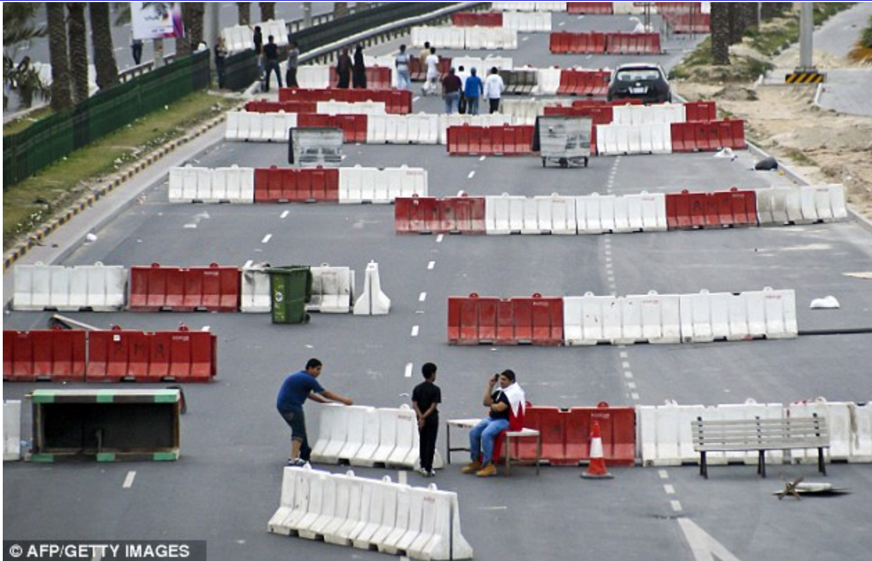
Bahraini anti-government protesters are shown setting up blockades in Manama

The cost of insuring Bahraini sovereign debt against default rose further on Monday, approaching 20-month highs after Saudi troops entered Bahrain.