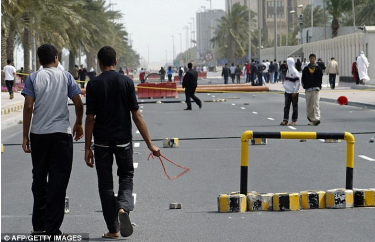
Bahraini anti-government protesters walk towards makeshift roadblocks in the capital Manama today, a day after Bahraini police clashed with demonstrators