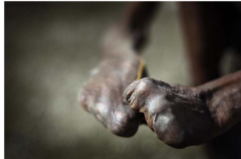
Hands of a Leper

→ Isaiah 52:13-15 13 Behold, My Servant shall deal prudently; He shall be exalted and extolled and be very high. 14 Just as many were astonished at you, so His visage (His physical appearance) WAS MARRED MORE THAN ANY MAN, and His form more than the sons of men; 15 SO SHALL HE SPRINKLE MANY NATIONS. Kings shall shut their mouths at Him; for what had not been told them